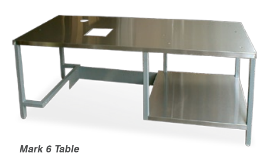
Other companion equipment for a Mark 6 donut system

The FT2DW Mounting Table (left) secures the Feed Table while allowing it to slide back while cake donut production is in progress. It is movable on heavy duty height-adjustable casters. The Mark 6 Table supports and locks down the fryer, has holes for the fryer drain and EZ Melt refill tube, and is height adjustable. It houses the EZ Melt 34 shortening filter below the fryer. Both tables make efficient use of space with storage available for shortening blocks, glazing screens, proofing cloths and proofing trays.